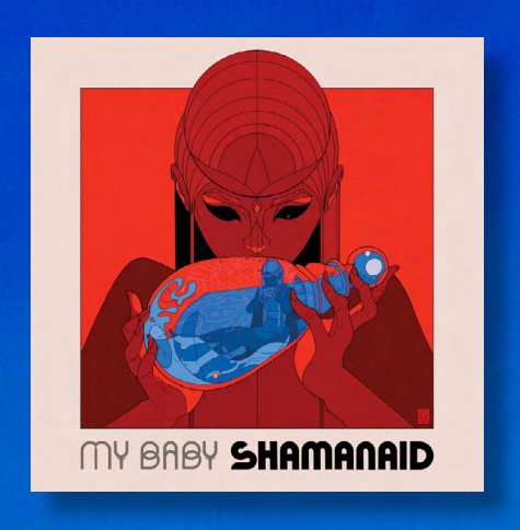
Shamanaid | 2015