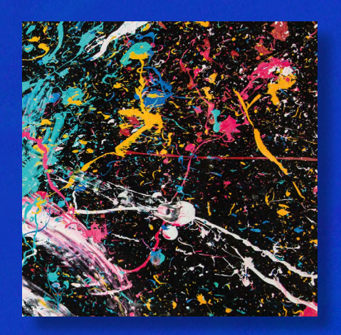
Live! | 2019