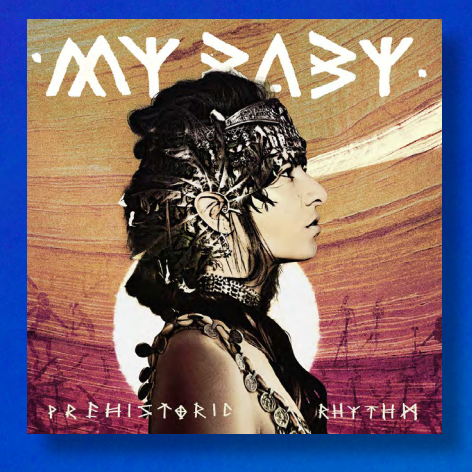
Prehistoric Rythm | 2017