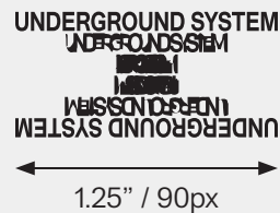
Minimum Size of Logo 1.